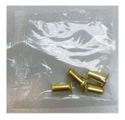
Note: For high current load application, use the ferrules/sheaths provided for wire terminations.